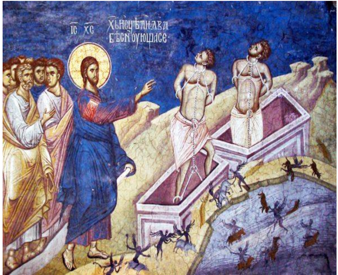
Christ and the Two Demoniacs