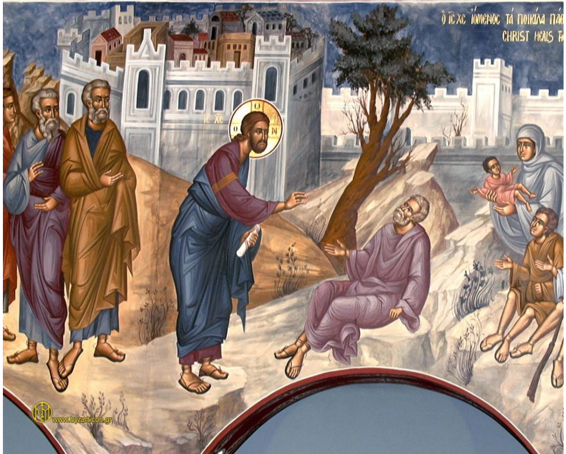
Christ healing the blind man of Jericho