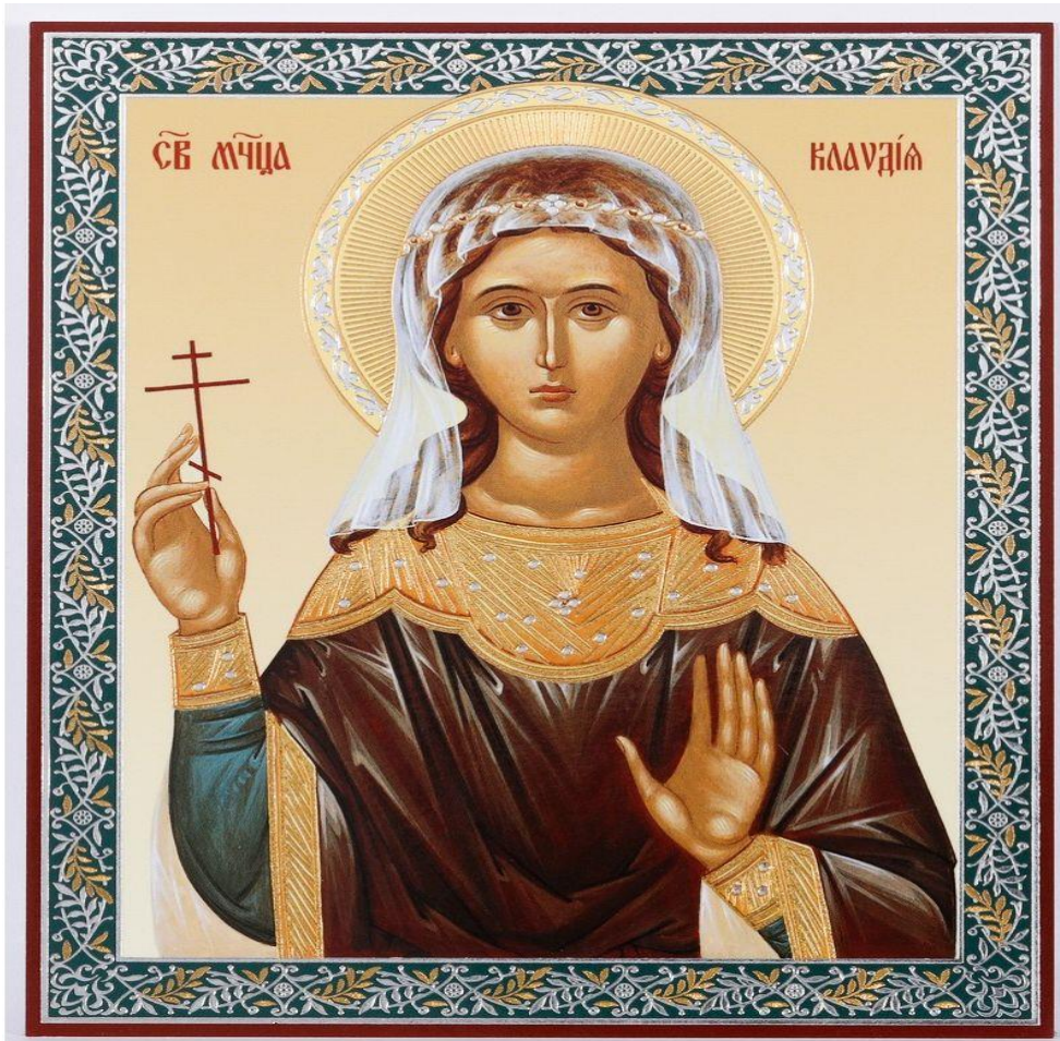
St. Procla (Claudia)